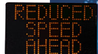
Three line text