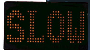
One line text

NorthStar message boards feature a sturdy welded steel frame. Balanced placement of the batteries, dependable surge brakes and our advanced torsion axle suspension system provide years of smooth, trouble free towing. A durable powder coat finish provides superior corrosion protection from salt spray or stone chips to keep your NorthStar message board looking good for years to come. A choice of a 2" Ball or Pintle couplers is available to meet your specific towing requirements and the 4 leveling jacks allow for stable, level placement of the unit on any terrain.