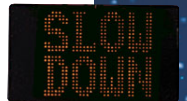
Two line text